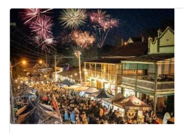
Millthorpe Fire Fair