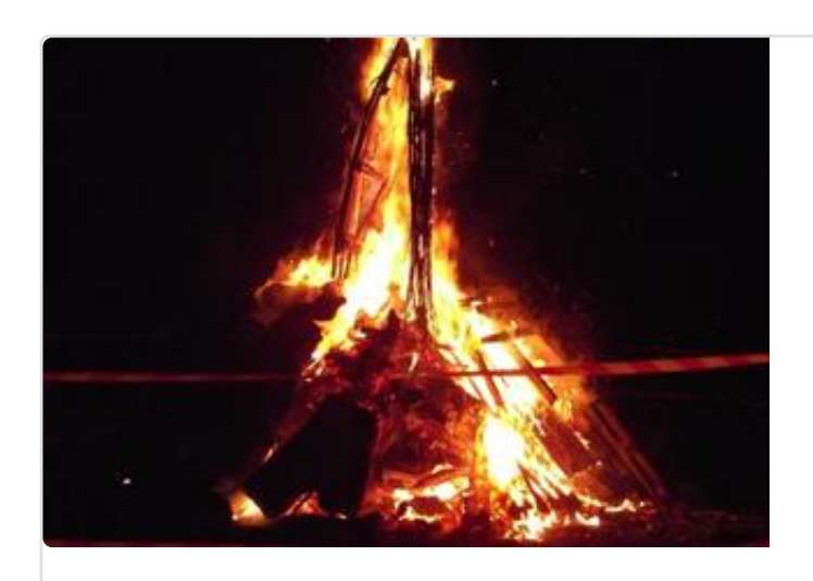
Newbridge Winter Solstice Festival