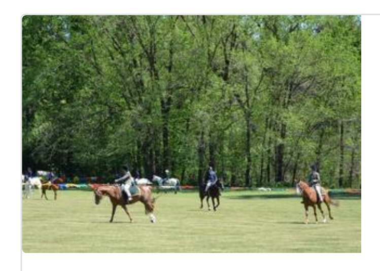
2024 Carcoar Show

Spring into Art at Newbridge is a spring celebration of open gardens, live music, artisan markets, art exhibitions and the Back Creek Art Show, held in the Blayney Shire village of Newbridge.