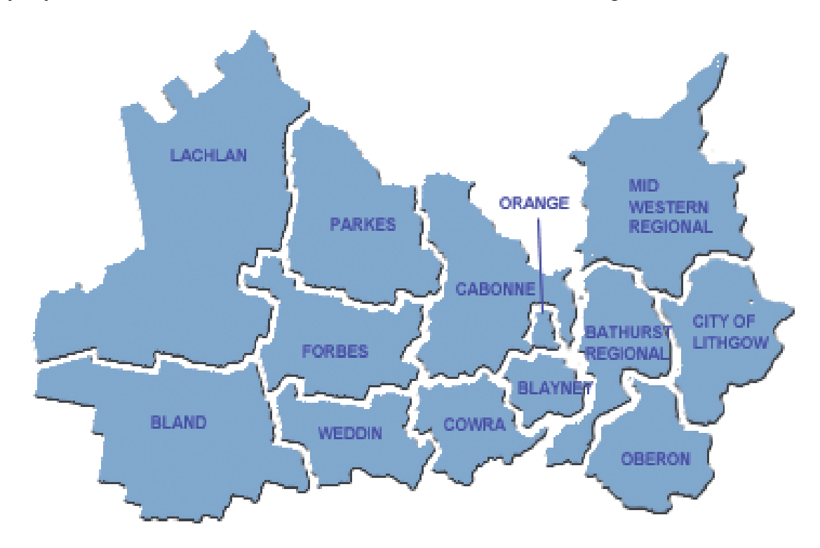
Figure 2: Location of Blayney Shire in the NSW Central West

Blayney Shire Council is a member of the Central NSW Joint Organisation.