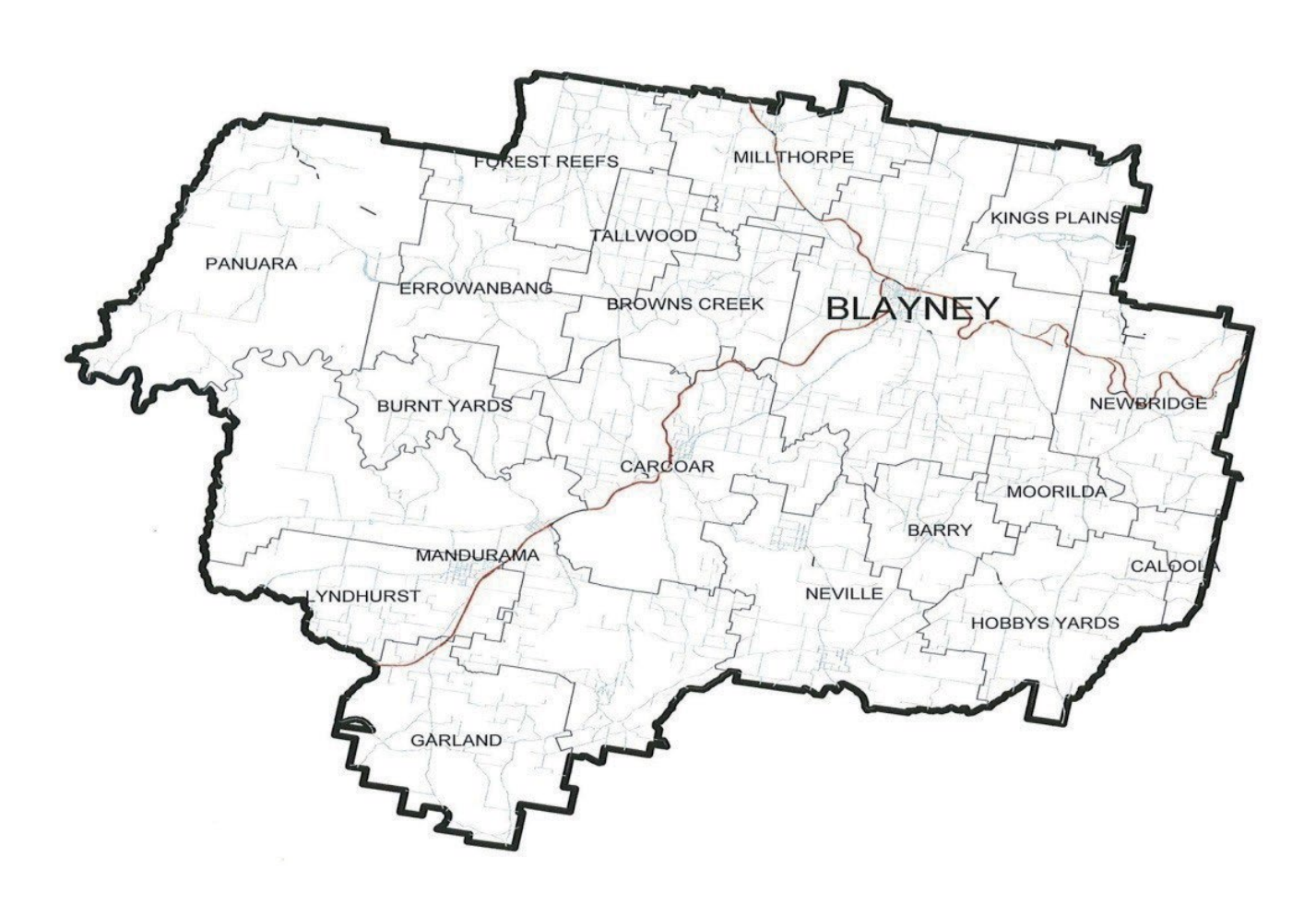
Figure 1: Map of Blayney Shire Local Government Area Boundaries

It is the centre of a district, which stretches east to Bathurst, southwest to Cowra and north to Orange. Blayney Shire is comprised of a number of villages and localities including Millthorpe; Carcoar; Mandurama; Lyndhurst; Neville; Newbridge; Hobbys Yards and Barry.