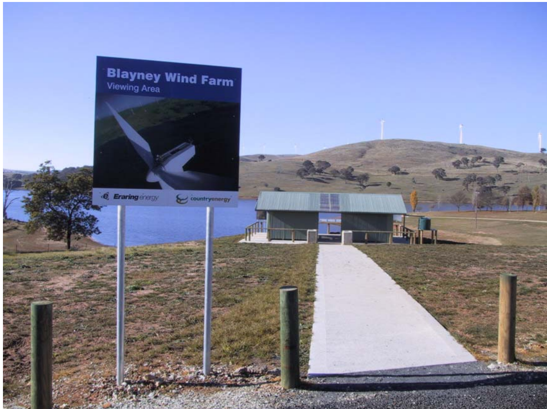
Viewing platform located at Carcoar Dam