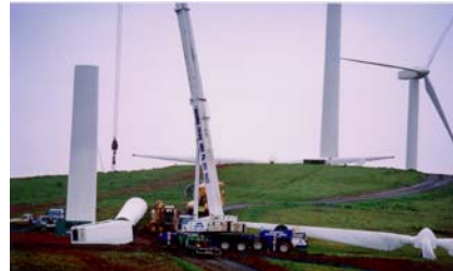
Erection of wind rotor and massive crane assembling a tower at the Blayney Wind Farm